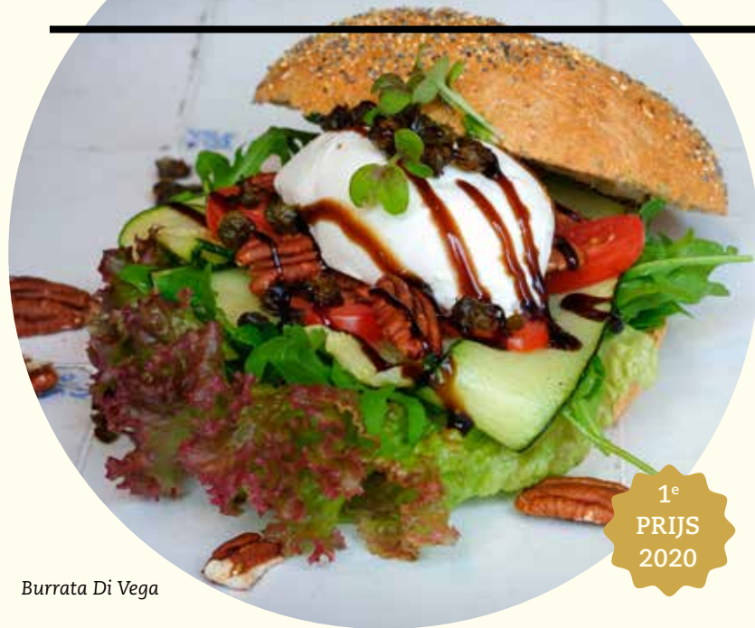
Burrata Di Vega