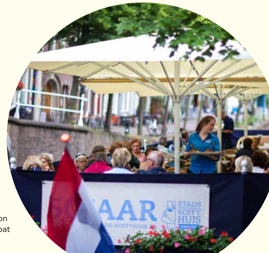
The summer on our terrace boat