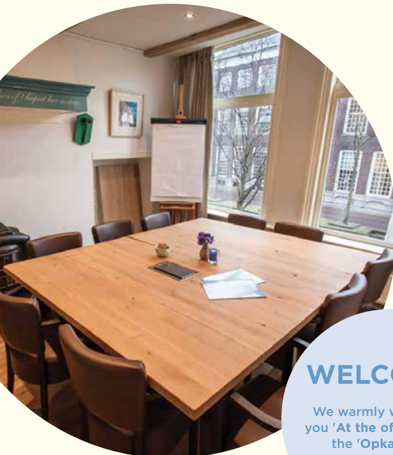
Meeting room 'At the office'