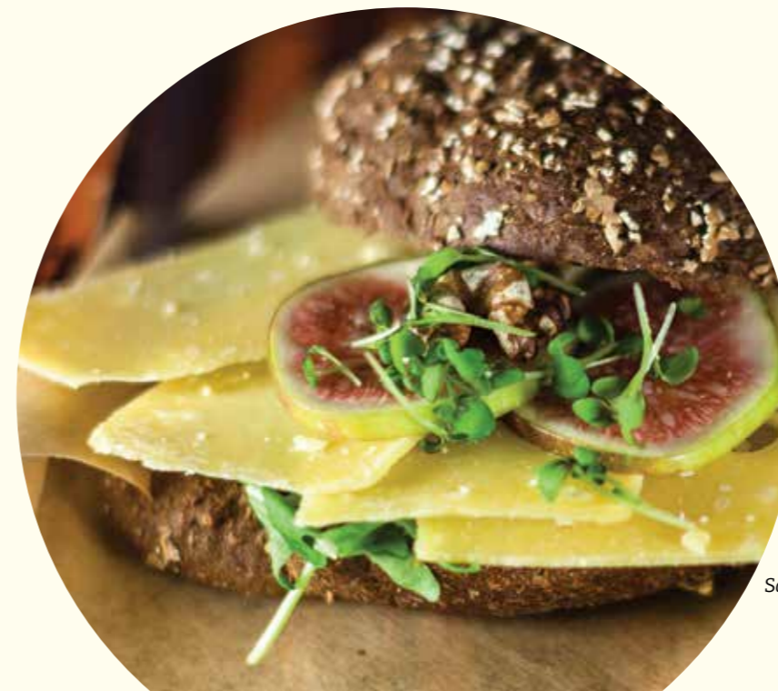
Sandwich Take Time

Prefer a large glass of orange juice? That's possible for + 1,50