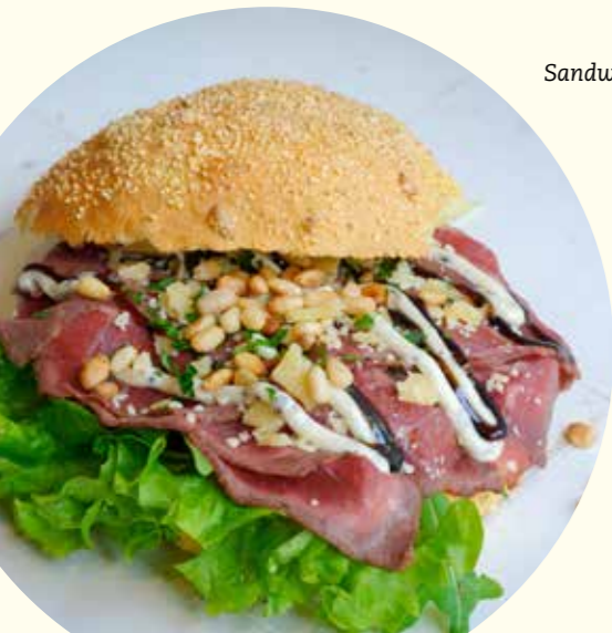
Sandwich Roast Beef

A dark Gildekorn bun with aged farmer's Gouda cheese, apple syrup, spicy mustard, rocket, fig spread (100% figs) and walnuts – a wonderful combination.